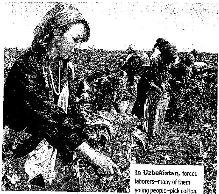
In Uzbekistan, forced laborers—many of them young people—pick cotton.

His plight is shared by millions of people in the world today. More than 27 million live in “modern slavery,” according to the U.S. Department of State. That includes 60,000 in the U.S., according to the Global Slavery Index, which tracks the phenomenon around the globe.