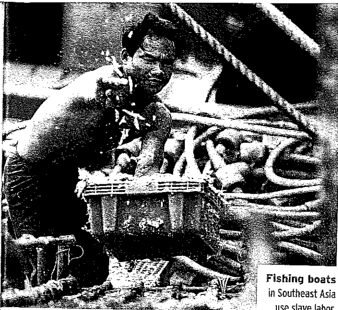
Fishing boats in Southeast Asia use slave labor.