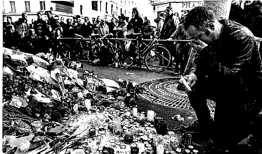
Mourning the victims of the ISIS terrorist attacks in Paris; 130 people were killed.

Years of costly U.S.-led wars in Iraq and Afghanistan have left many Americans wary of getting stuck in another conflict. Although President Obama has refused to send ground troops to Syria, he authorized