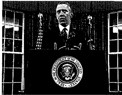
President Obama speaking to the nation from the Oval Office in December

Obama said the U.S. would intensify airstrikes against ISIS in Syria and Iraq and reassured Americans that the growing